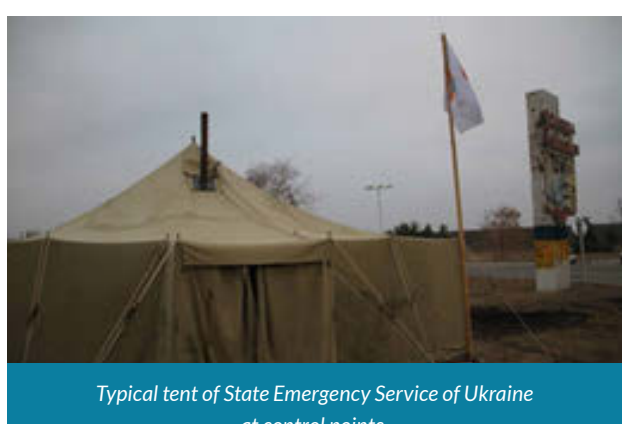
at control points.

State Emergency Service of Ukraine. The work of this service is organized quite well in the Luhansk region, while in the Donetsk region it has a serious problems with organization. For example, the tent of this Service in the Donetsk - Mariupol traffic corridor is located not before, but after the control point