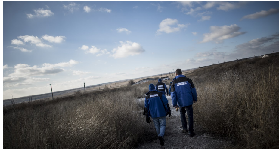
The SMM monitors conducting a foot patrol, December 2015.