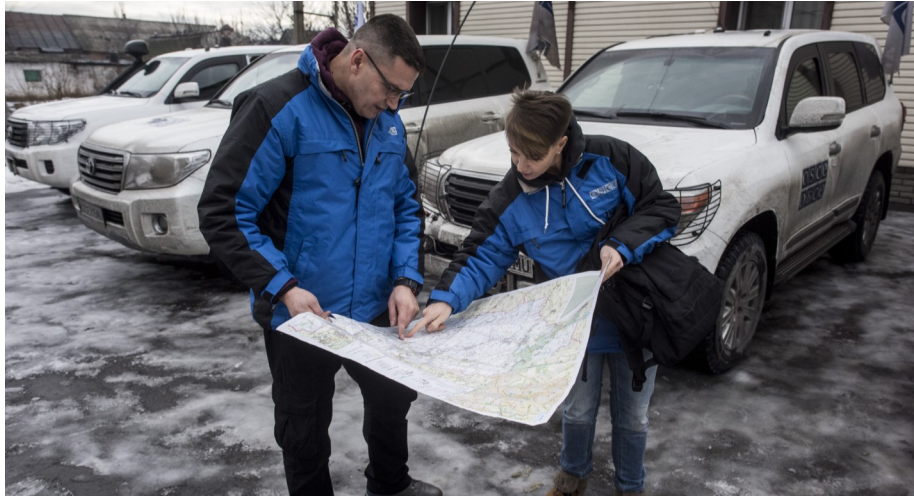
OSCE monitors preparing for patrol, 14 January 2016.