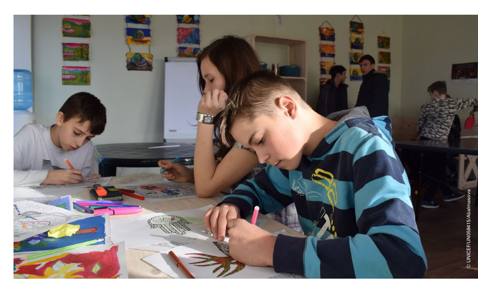
A boy colours in a mandala at a youth centre in Mariupol. These intricate designs are used in art therapy to calm children and teenagers down, boost their courage and prepare them for counselling sessions.

AN ASSESSMENT OF THE SITUATION OF CHILDREN AND THEIR FAMILIES LIVING IN GOVERNMENT-CONTROLLED AREAS ALONG THE CONTACT LINE IN THE EAST UKRAINE CONFLICT ZONE.