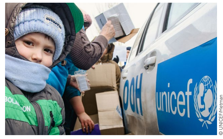
Child waiting for hygiene supplies with his mother in Avdiivka

<sup>54</sup> In theory, even a small FAP should be able to handle a birth, as they are supposed to have trained midwifes, but we have heard of no cases where this actually happens and doctors report that all births take place in hospitals.