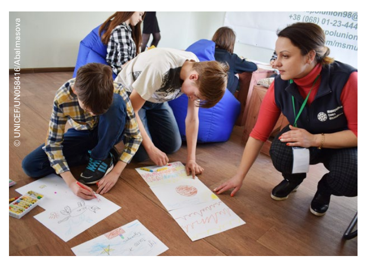
Children participate in a drawing session at a youth club in Mariupol.

Over three-quarters of school directors and teachers interviewed in the 15km zone and nearly all in the 5km zone noted striking behavioral changes in students from before the conflict. In heavily shelled districts in particular, numerous children show symptoms consistent with post-traumatic stress disorder according to the trained psychologist who assisted in these interviews. Interviews with school psychologists and psychologists from UNICEF community protection mobile teams also support the presence of these symptoms.<sup>16</sup>