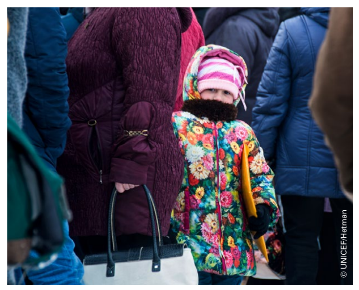
Girl forced to leave her neighborhood in Avdiivka during heavy fighting waiting with others to return home

In Ukraine, attending kindergarten is not legally required, and while a small number of children would be kept out of kindergarten by their parents regardless of the situation, many other children are not attending kindergarten because of the conflict. Some parents are afraid to let their children attend kindergarten in areas that have been shelled, others would like to send their children to kindergarten but have