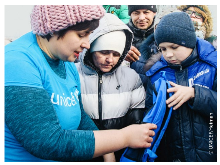
Child receiving a backpack with school supplies

"Before the conflict they had places to go and things to do outside of school... now they can't even go to the river or fields [because of mines]... the school is the only place they can go that's warm and has clean drinking water. It's the place to see friends and get a hot meal, even if [the meals] aren't as good at before... you should see the children when they wash their hands; they are sometimes startled and pull their hands back for a second because they forget that the water is actually warm and not freezing like at home." <sup>34</sup>