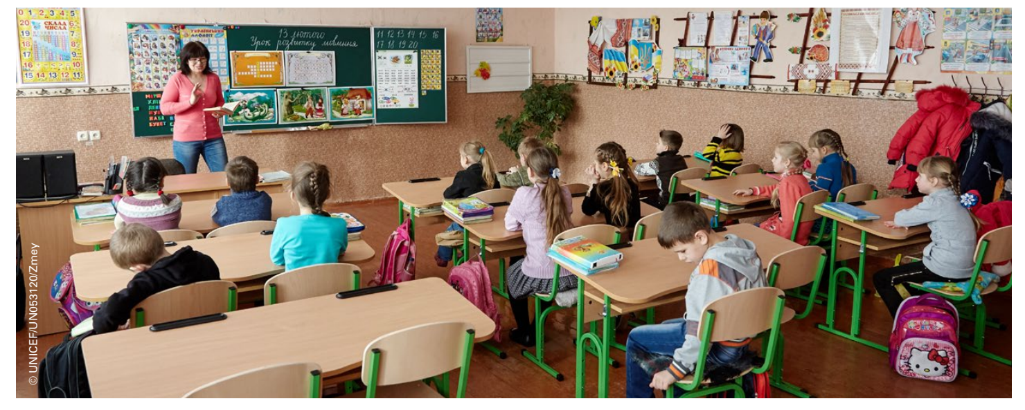
First grade students attend a class in Toretsk school No.20. Classes starts on time despite the ongoing armed conflict, which has damaged or destroyed more than 740 schools in eastern Ukraine since early 2014.

Pre-conflict schools that remain closed include Shyrokyne (town largely destroyed and entire population gone), Lebedynske (under frequent bombardment, no child left in town according to city council), Pavlopil (occupied by soldiers as of December 2016), Novotroitske boarding school (at one time occupied by soldiers, now damaged), Marinka boarding school (students moved to Sviatohirsk), multiple schools in Krasnohorivka (all children moved into one facility), Pisky (town depopulated), Opytne (mostly depopulated, facility damaged), multiple schools in Avdiivka (damaged facilities,