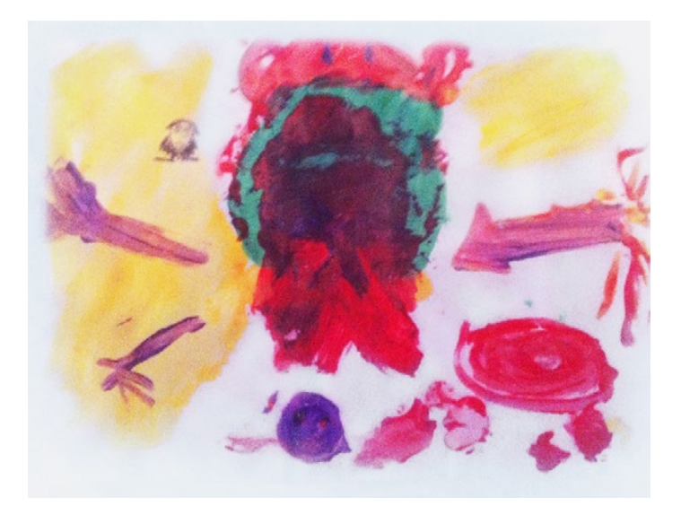
Art therapy drawing by an eight-year old girl living on the 'contact line': dismembered human torso at a checkpoint.

The prevalence and severity of psychosocial distress is directly linked with the severity, duration and persistence of conflict. This puts areas such as the section of the contact line from Marinka to Verkhnotoretske among the regions with the highest frequencies of severe cases. Frequently mentioned sources of extreme trauma as related by psychologists who worked with children on the contact line in 2015 and 2016 include being in or near explosive blasts, being wounded, seeing dead or badly injured bodies (including those of acquaintances or family) and family separations during evacuations. Commonly reported symptoms by directors, teachers, psychologists