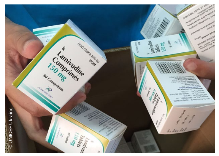
Lamivudine, an Anti Retroviral Drug for HIV procured by UNICEF.

In Luhansk Oblast GCA there are no facilities capable of performing either of the lab tests. Because of this shortage of testing capacity, the majority of regions in Donetsk Oblast (GCA)<sup>49</sup> and all of Luhansk Oblast (GCA) send samples to Kharkiv for analysis. From Stanytsia Luhanska, for example, this is almost 400 km away, with sections of very bad roads and many checkpoints. Places like the AIDS desk in Avdiivka send blood samples once a month by public bus to Kharkiv.