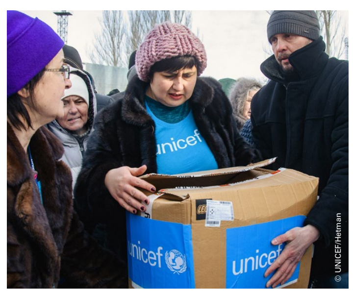
UNICEF staff distributing supplies in Avdiivka after renewed fighting

For Donetsk and Luhansk Oblasts (GCA) no respondents reported a problem with testing pregnant women for HIV and it appears that this is the only segment of the population that receives systematic testing. In emergency or last minute births at hospitals,<sup>54</sup> women are supposed to be rapid tested. It is unclear if this actually occurred last year in Luhansk (GCA) or if it will be possible at all hospitals in Luhansk (GCA) next year. Further research is recommended.